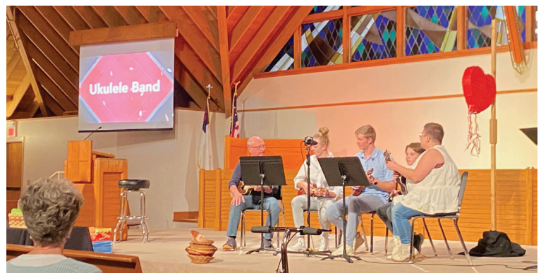
Ukulele Band Performance

so...Happy Thanksgiving to all - to all good night Go build relationships while we eat that pie!!