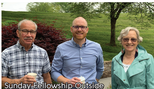
Sunday Fellowship Outside