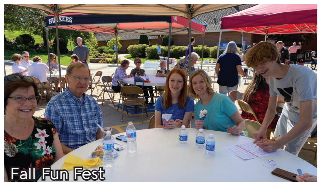
Fall Fun Fest