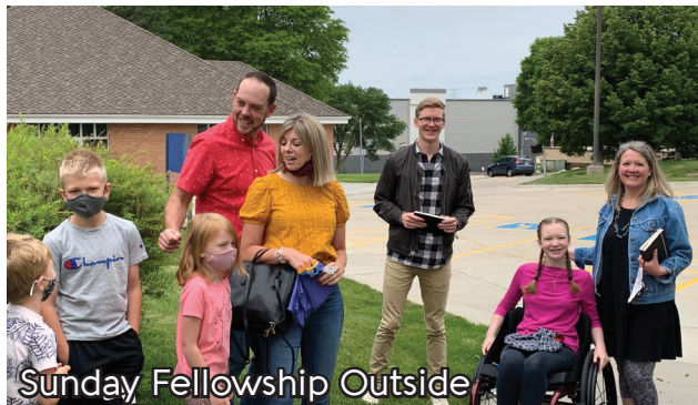
Sunday Fellowship Outside