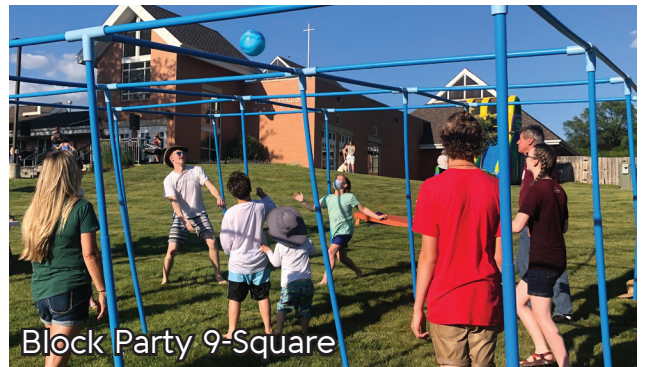
Block Party 9-Square

All-in-all, our teams continue to work together, searching for ways to keep Spiritual Formation and Discipleship vital and provide opportunities to strengthen our focus on God the Creator and build disciples that bring glory to Him who gave us life. As believers, we all have a role to play to advance God's plans with a loving and serving heart.