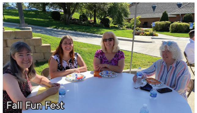
Fall Fun Fest