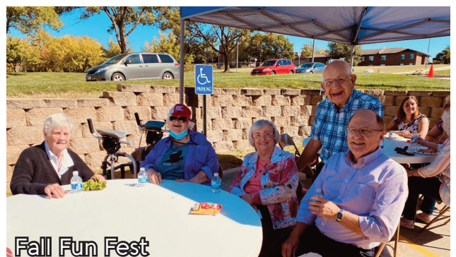
Fall Fun Fest