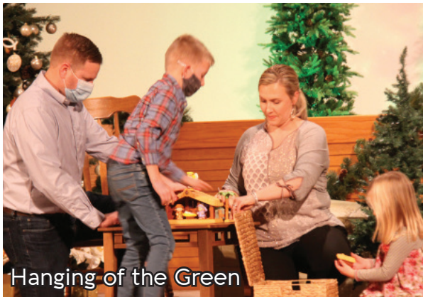
Hanging of the Green