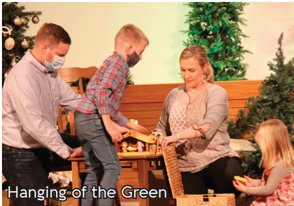
Hanging of the Green