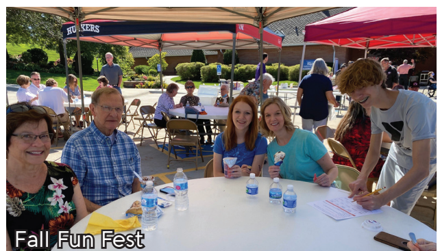
Fall Fun Fest