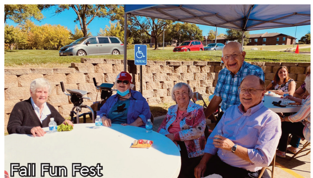
Fall Fun Fest