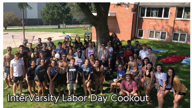
InterVarsity Labor Day Cookout

In September, West Hills Mission and Family Ministries worked together to host the annual InterVarsity Labor Day Cookout . Around 100 students from UNO, Creighton, and Metro Community College came to West Hills to enjoy food, fun, and friends on the front lawn.