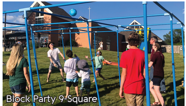
Block Party 9-Square

All-in-all, our teams continue to work together, searching for ways to keep Spiritual Formation and Discipleship vital and provide opportunities to strengthen our focus on God the Creator and build disciples that bring glory to Him who gave us life. As believers, we all have a role to play to advance God's plans with a loving and serving heart.